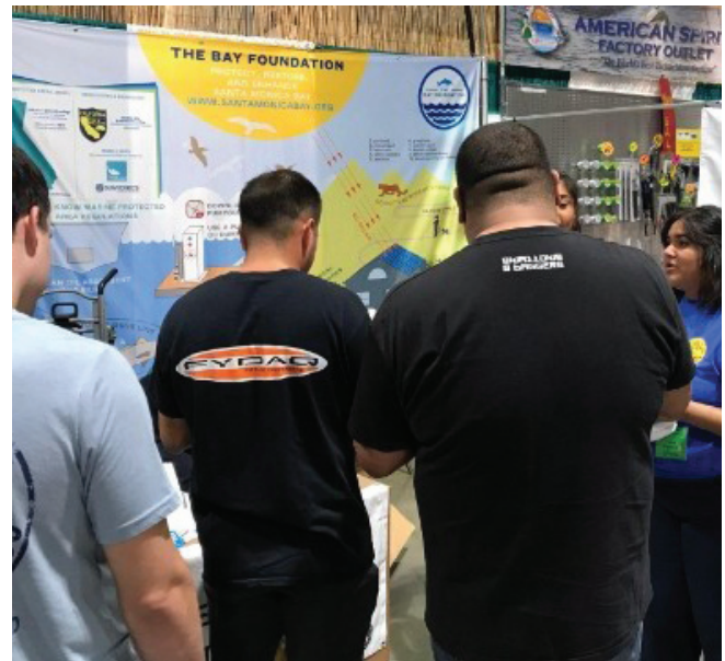
Spectacular Dockwalking by the Conservation Corps of Long Beach

Don't miss meeting with Dockwalkers at Marina del Rey's Marina Fest , held June 20-21, to learn how to make a positive impact while on the water.