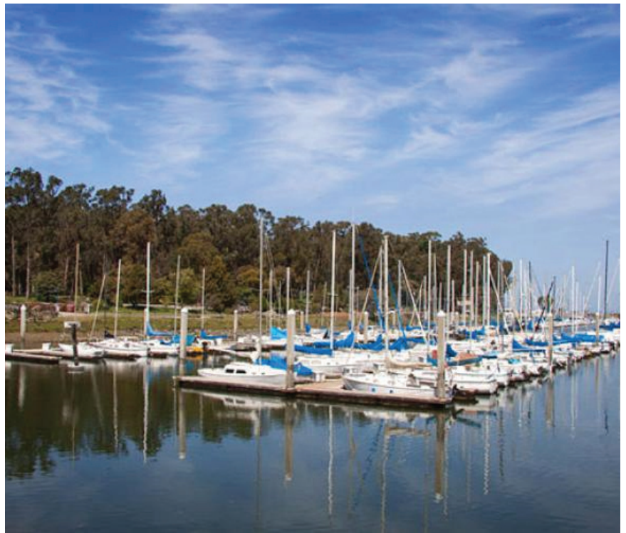
Coyote Point Marina, North Dock View