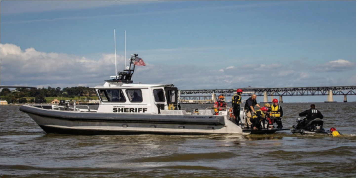
Contra Costa Marine Patrol Unit in action